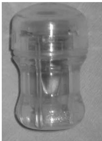
Figure 1: INVOcell fully assembled device, before positioning in the vagina.

This device is made of two parts, the inner chamber that contains the culture medium [Complete P1 SSS (Synthetic Serum Substitute) from Irvine Scientific, Irvine, CA, USA, was used successfully in a clinical trial] and the gametes and the outer rigid shell that keeps the orifice of the valve sterile and protects the inner chamber from the vaginal contaminations.